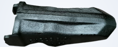
K-100 Heel Type (Loader)