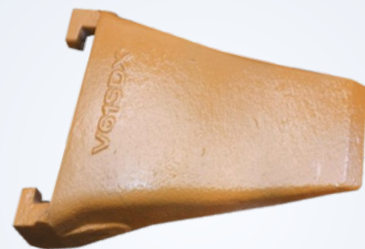
VOLVO V61 SDX