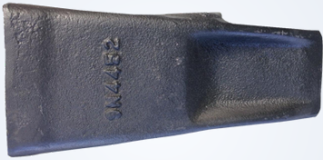
9N-4452 Bucket Tooth