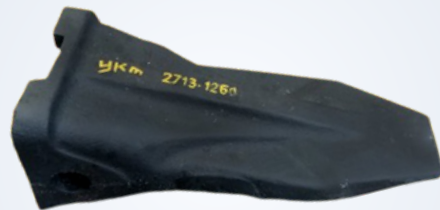
2713-1260 AH Bucket Tooth