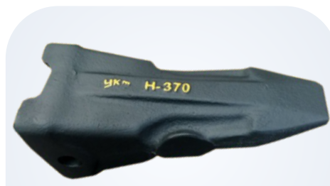
Hidromek 370 Bucket Tooth