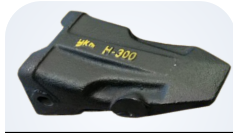
Hidromek 300 Bucket Tooth