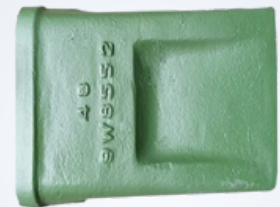
9W-8552 Rock Type