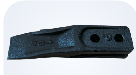
Hidromek 100 Bucket Tooth (Medium Duty)