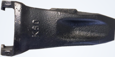
K80 Bucket Tooth