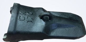
K170 Bucket Tooth (Top-Pin Type)