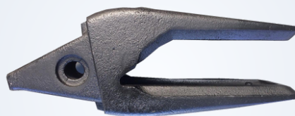
2713-1237 Adapter 50MM