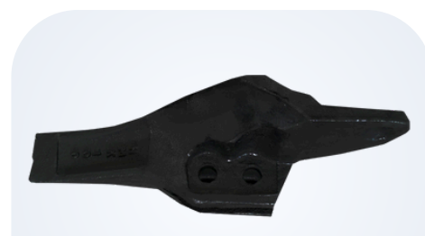
Hidromek 100 Bucket Tooth (Left Corner)