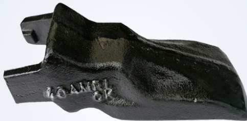
VOLVO 40 AMRL