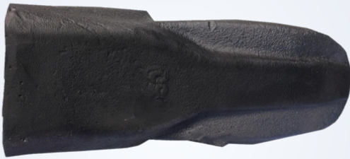
M.A 50 Bucket Tooth