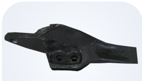
Hidromek 100 Bucket Tooth (Right Corner)