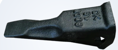
CAT 6Y-0309 Ripper Tooth