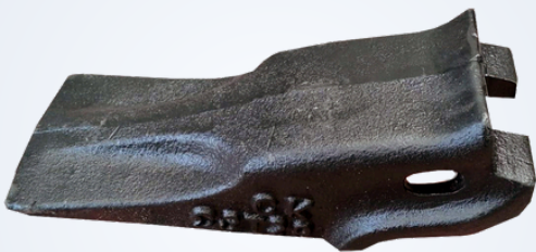
Volvo C3 V29T Bucket Tooth