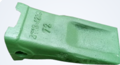
2713-1219 Rock Type