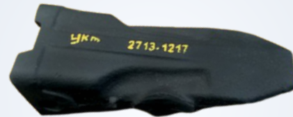
2713-1217 RC Bucket Tooth