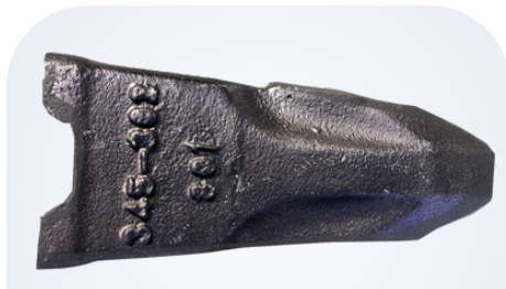
345-302-801 Bucket Tooth