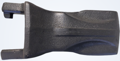
V-65 AH Bucket Tooth