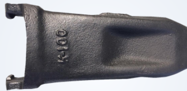
K100 Bucket Tooth