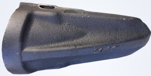
K40 350-400 AH Bucket Tooth