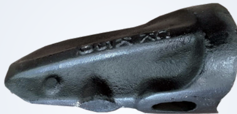
Komatsu K50 Tooth (PC600)