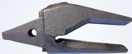
2713-1270 Adapter 70MM