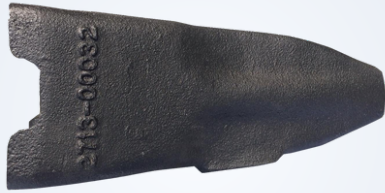
2713-0032 Bucket Tooth