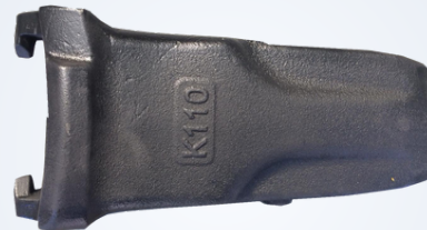
K110 Bucket Tooth