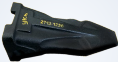
2713-1236 AH Bucket Tooth