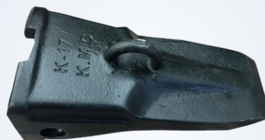
K17 Bucket Tooth (Side Pin)