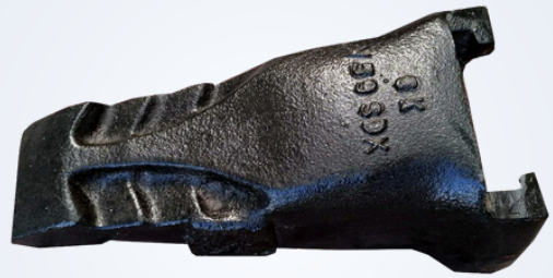
VOLVO V59 SDX