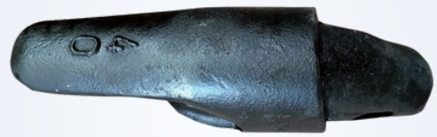
K40 Adapter 350-400 60 MM