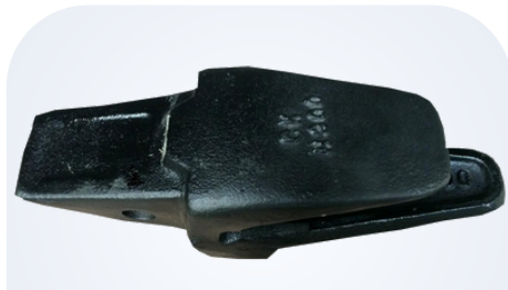
Hidromek 300 Adapter