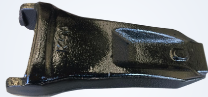
K90 Bucket Tooth