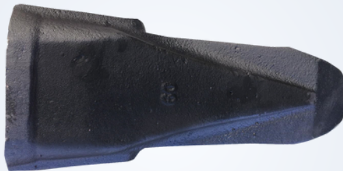
M.A 60 Bucket Tooth