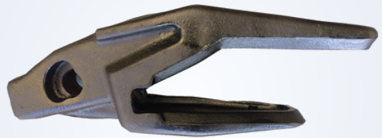
M.A 50 Adapter