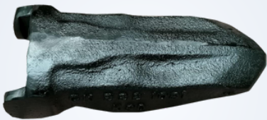
K-90 Heel Type (Loader)